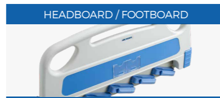
HEADBOARD / FOOTBOARD