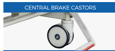
CENTRAL BRAKE CASTORS