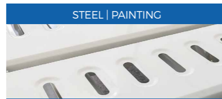
STEEL | PAINTING